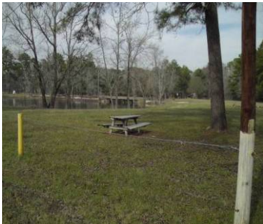
Soon we will have new picnic tables.