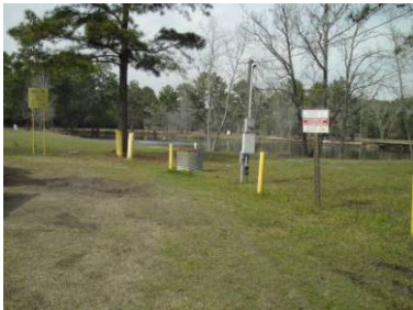
The parking area is next to be fixed

Major cleanup around the lake took place in January. Don Humphreys Tractor Work and Kenneth Langley Lawn & Tree Service cleared brush and trimmed low hanging branches along the shoreline to give our park grounds a well-groomed look. Kenneth and Don took out several dead trees such as the ones along Park Forest Drive. Now it is possible to look from Pine Spring across the lake to Park Forest.